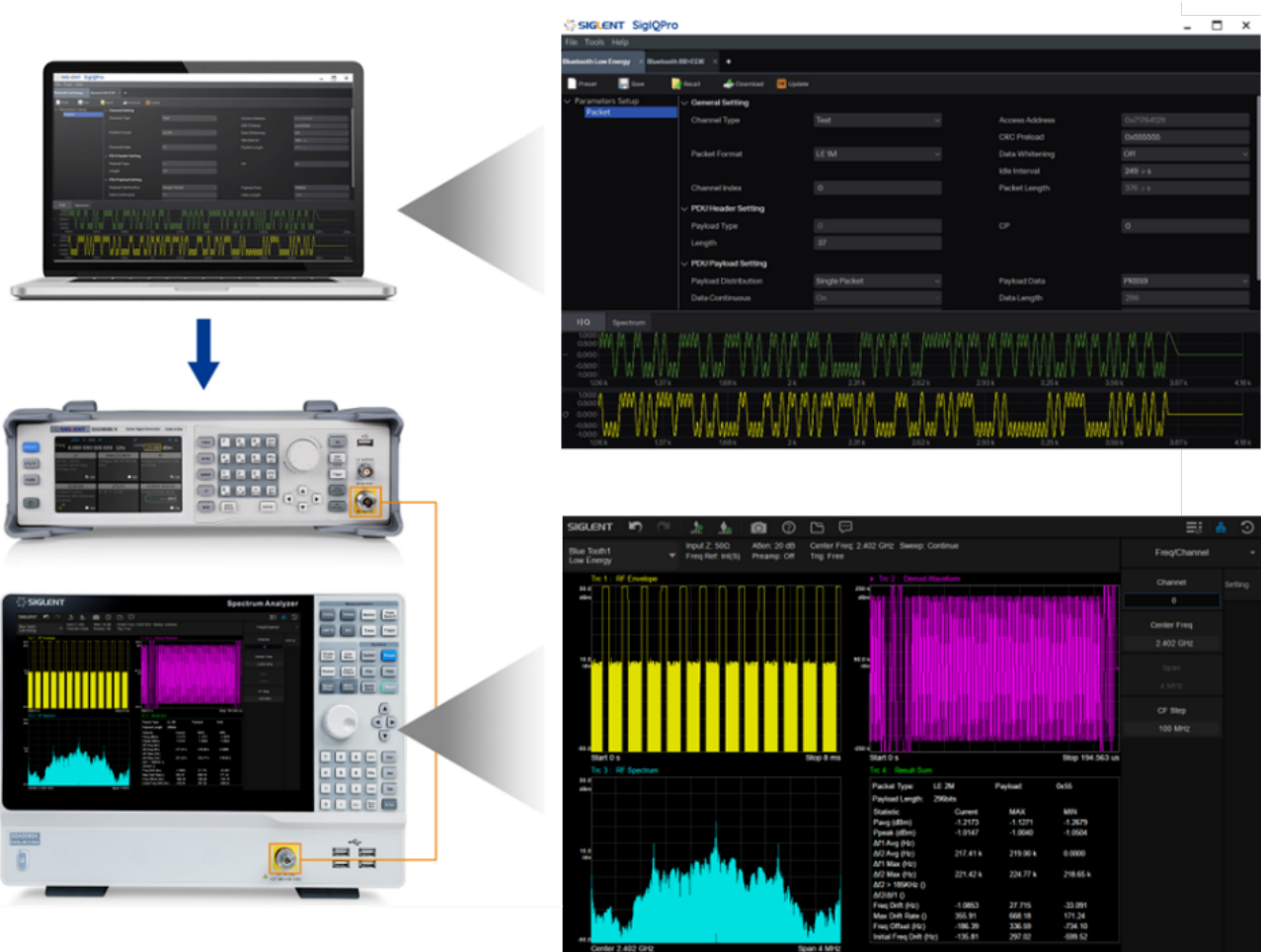
Figure 1-1 Connection settings